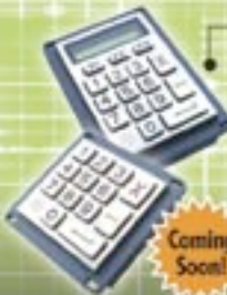
SmartPIN PCI approved PIN Entry Device. Stainless Steel Key Caps and LCD display option available