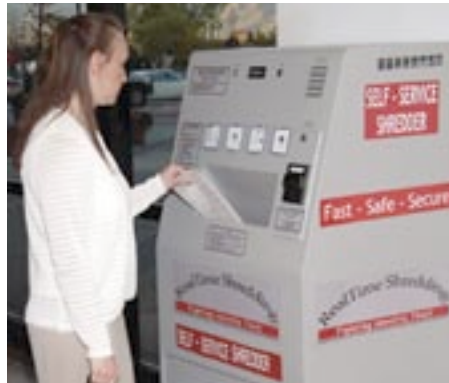
> RealTime Shredding’s kiosk makes quick work of disposing of sensitive data.

Finally, we come to the most noble cause we’ve seen lately, spearheaded by Carnegie Mellon University’s Entertainment Technology Center.