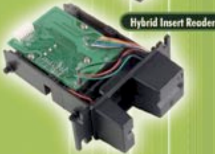
Hybrid Insert Reader