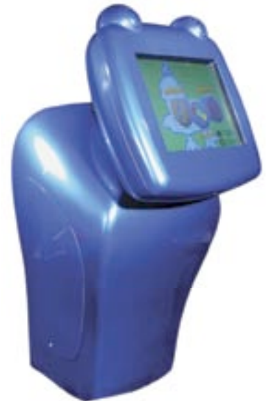
> Project ER, from Arc Design and Carnegie Mellon University, makes a trip to the hospital more pleasant for sick children.