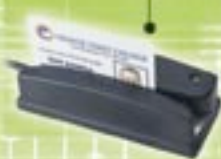
OMNI Heavy duty single or dual head MagStripe and/or Barcode slot reader, In/Out door with weatherized option