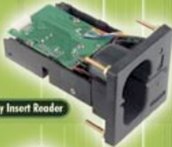
Mag Only Insert Reader